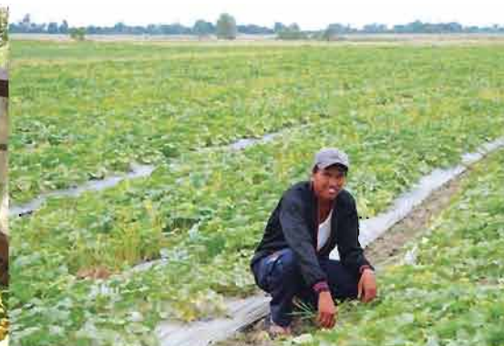
Among those interviewed included project beneficiaries of the Agrikulturang Kaugapay ng Bayang Pinoy Program (AKbay) beneficiaries in Butuan (left) and the Young Filipino Farmers Training Program in Japan (YFFPTJ) in Nueva Ecija (right).