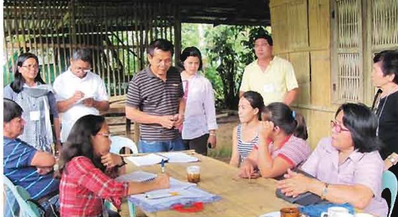
During the Trainors' Training, the participants conducted actual field monitoring of pre-identified projects using the M&E Instruments. This is to prepare them in holding "re-echo" seminars of their learning to other members of the AFC monitoring teams in their respective areas.

The National Agriculture and Fishery Council (NAFC) and the Agricultural Credit Policy Council (ACPC) have completed conducting the series of "Trainors' Training on the Use of the Agri-Fishery Council (AFC) Monitoring and Evaluation (M&E) Instruments" for Mindanao and Luzon-based Agri-Fishery Councils (AFCs). The NAFC-ACPC training series for the Mindanao and Luzon regions was conducted in the last quarter of 2013.