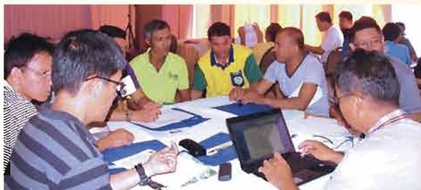
Participants in the Ugnayang Agri-Credit and Business Planning Seminar in Surigao City developed and presented sample business plans during the workshop on business planning.

Nineteen (19) participants representing various financial, academic, and cooperative organizations attended the activity.