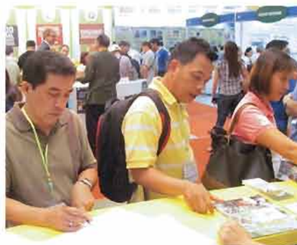
Agrilink 2013 visitors queued at the Department of Agriculture Information booth to get copies of Philippine Agri-Finance News magazine and other information materials.