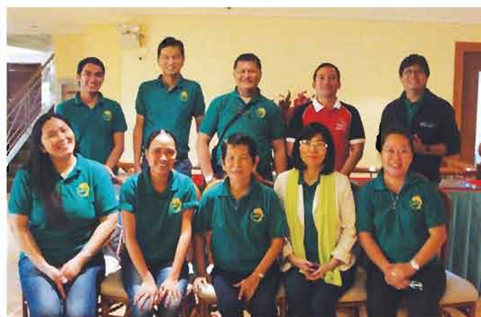
Participants in the Cagayan de Oro City orientation-workshop.