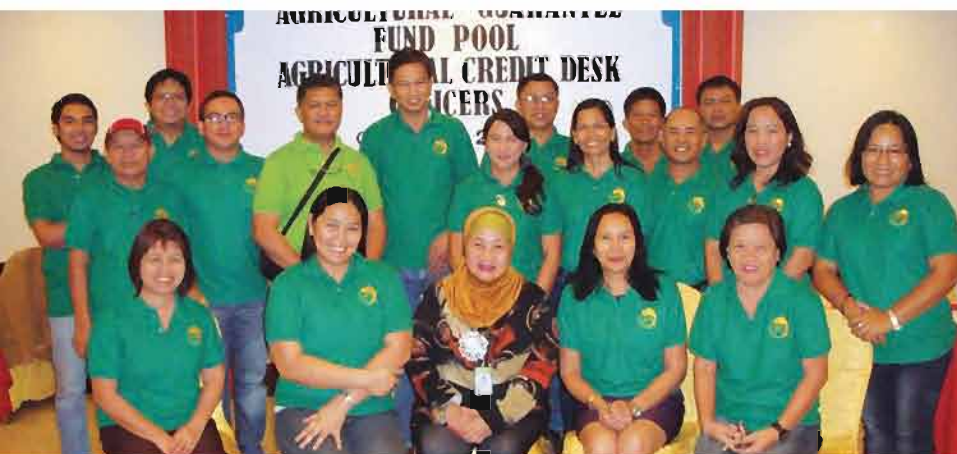
Participants in the orientation-workshop in Davao City.