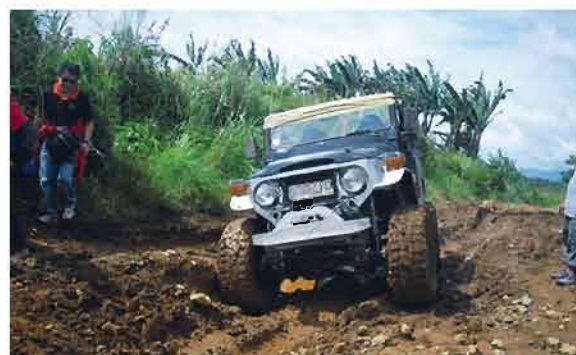
The OSFFO NTC team members get off the off-road service vehicle to safely navigate their way to validate a finalist organization in North Cotabato.

The field evaluation was conducted by the NTC validating team from July to September.